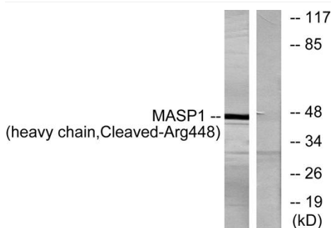
Western blot analysis of lysates from A549 cells, treated with etoposide 25uM 24h, using MASP1 (heavy chain, Cleaved-Arg448) Antibody. The lane on the right is blocked with the synthesized peptide.